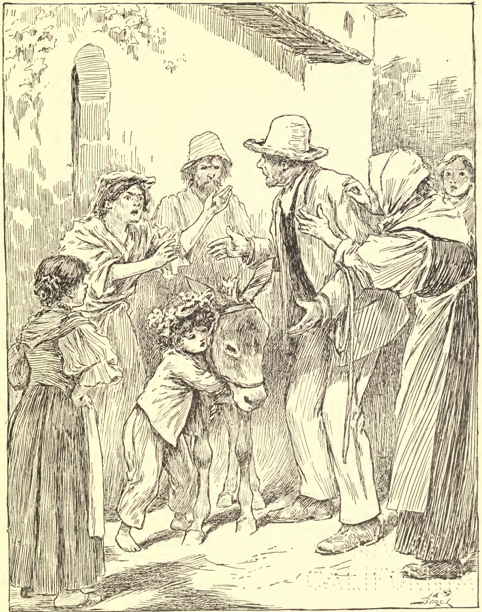
“PICCINO CLUNG TO THE DONKEY, RUBBING HIS CHEEK WOFULLY AGAINST HER GRAY SHOULDER”